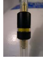
Flow Level Too High

Ensure however that a constant flow of gas can be heard venting from the Sensor Flow Adapter.