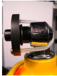
Fitted to an 'A' Clamp Valve