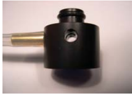
Sensor Flow Adapter

A Flow Meter is fitted in the hose approximately 150mm from the adapter. If the flow rate is too high the clear window of the Flow Meter turns yellow. If this occurs the cylinder valve must be partially further closed to reduce the flow until this window is once again clear. See the photo's below: