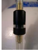
Flow Level OK