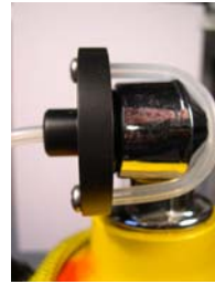
Fitted to a DIN valve

A Flow Meter is fitted in the hose approximately 150mm from the adapter. If the flow rate is too high the clear window of the Flow Meter turns yellow. If this occurs the cylinder valve must be partially further closed to reduce the flow until this window is once again clear. See the photo's below: