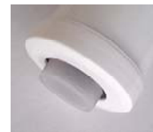
sensor with protection cap

Screwing the cap on the sensor during storage increases sensor lifetime.