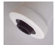
sensor without cap